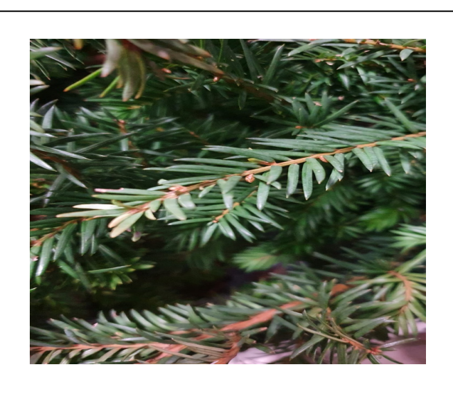
Figure 1: Yew needles of Tacus baccata.

A specific antidote is not available and therapeutic concepts are limited. Therefore, we present our interdisciplinary experience with a 33-year-old woman who survived yew intoxication. Additionally, we report on the potential novel usage of yew as a narcotic drug and discuss all relevant aspects of intoxication with Taxus baccata .