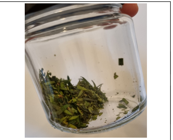
Figure 3: Preserving jar with conifer needles in toto and chopped.

The ECMO center was contacted for potential Extracorporeal Life Support (ECLS) and retrieval to the hospital. In the meantime, the hemodynamic situation stabilized. A head, thorax, and abdomen CT scan showed no abnormalities. The patient was finally transported to the ECMO center with ECMO stand-by for further diagnostics. Hemodynamics was maintained by amiodarone, and high dose of inotropic and vasoactive support. However, continuous stimulation by the external pacemaker was necessary. Blood samples were analyzed showing low potassium levels (3.1 mmol/L), and elevated liver enzymes (GOT 161 U/L, GPT 152 U/L). The LDH accounted for 382 U/L, and the neutrophilic count was 7820 per µL (79%). Lactate peaked at 2.8 mmol/L. Importantly, the patient 's personal belongings included a preserving jar with partly chopped conifer needles (Figure 3).