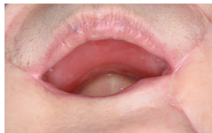
Figure 5: Postoperative clinical photograph of the patient.

The AP was vertically designed parallel to the imaginary occlusal plane through the gonial angle. It was assumed that the reconstructed vertical level by the plate and ALT flap would be similar to the original alveolar height. The anterior arch was designed according to the original shape and continued to the mandibular remnants in the horizontal view. Finally, the simulated mandibular model was fabricated. The reconstruction plate was pre-bent to fit the lower border of the simulated model and then the plate positioning guide was fabricated. The positioning guide enabled the mandible and the pre-bent reconstruction plate to be placed in stable positions and reproduced the simulated reconstruction [6].