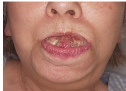
Figure 1: Preoperative clinical photo of the patient.

A 72-year-old female presented with extensive squamous cell carcinoma of the mandibular anterior gingival region and carcinoma of the left submandibular gland (Figure 1). The stereolithography files of the patient's maxillofacial bones were imported to computer-aided design software (Dental Modeling Software; Toyotsu Machinery, Tokyo, Japan) and a three-dimensional (3D) virtual model was created. Bilateral mandibulectomy, preserving the right gonial angle, and the complex soft tissue resection were planned based on the clinical examination, biopsy results, computed tomography scan, and magnetic resonance images. Plate reconstruction using a microvascular anterolateral thigh (ALT) flap was selected because of the large and complex soft tissue defect, comorbidities, and the patient's choice.