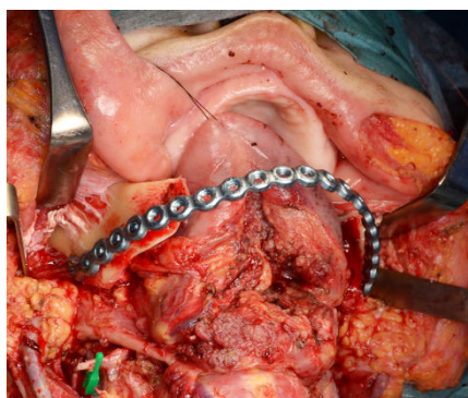
Figure 3: Intraoperative image of the reconstruction plate.