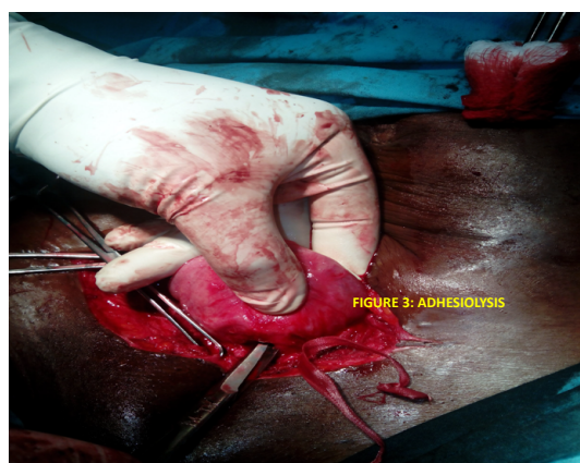
Figure 3: Adhesiolysis.