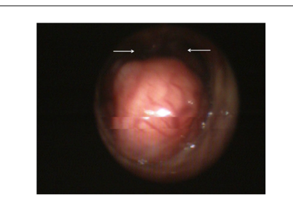
Figure 2: Preoperative bronchoscopy - case 2. Picture showing the near complete obstruction of both bronchus at the carina level.

keep it in place and a bronchial blocker (HS Hospital service<sup>*</sup>) was placed into the right main bronchus under FOB guidance. The advancement of the bronchial blocker was difficult due to tumor obstruction and bleeding. The internal jugular (15-F) and femoral (21-F) veins were cannulated. After confirming the correct placement of the V-V ECMO cannulae with mid-esophageal bivacal view in TEE, the patient was turned to left lateral decubitus position.