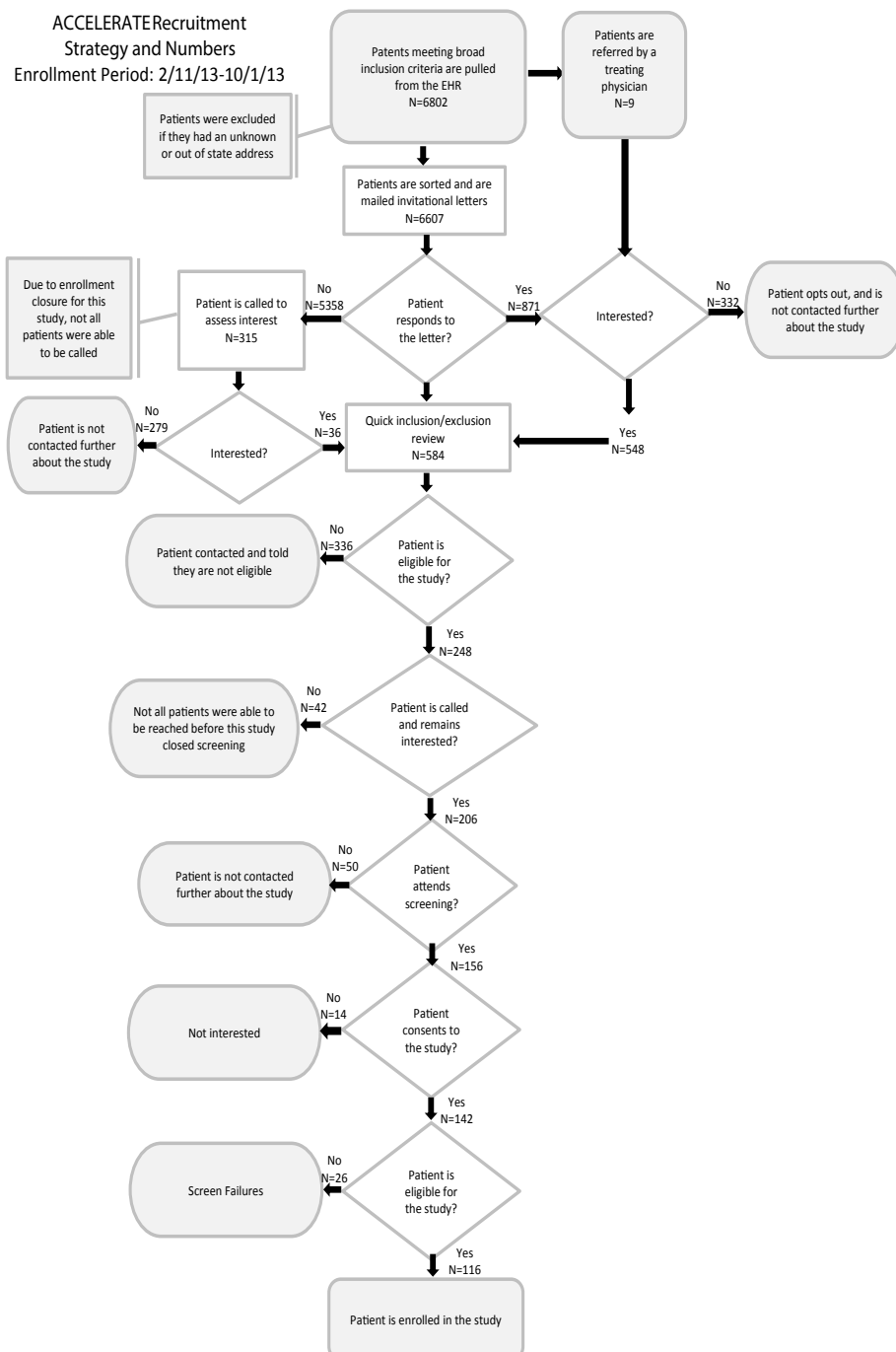
Figure 5: Accelerate Recruitment Strategy and Numbers.

The impact of Geisinger's EHR-based approach to enrollment was analyzed for these 5 double blind, randomized, placebo-controlled clinical mega-trials, all of which involved chronically-ill patients, who