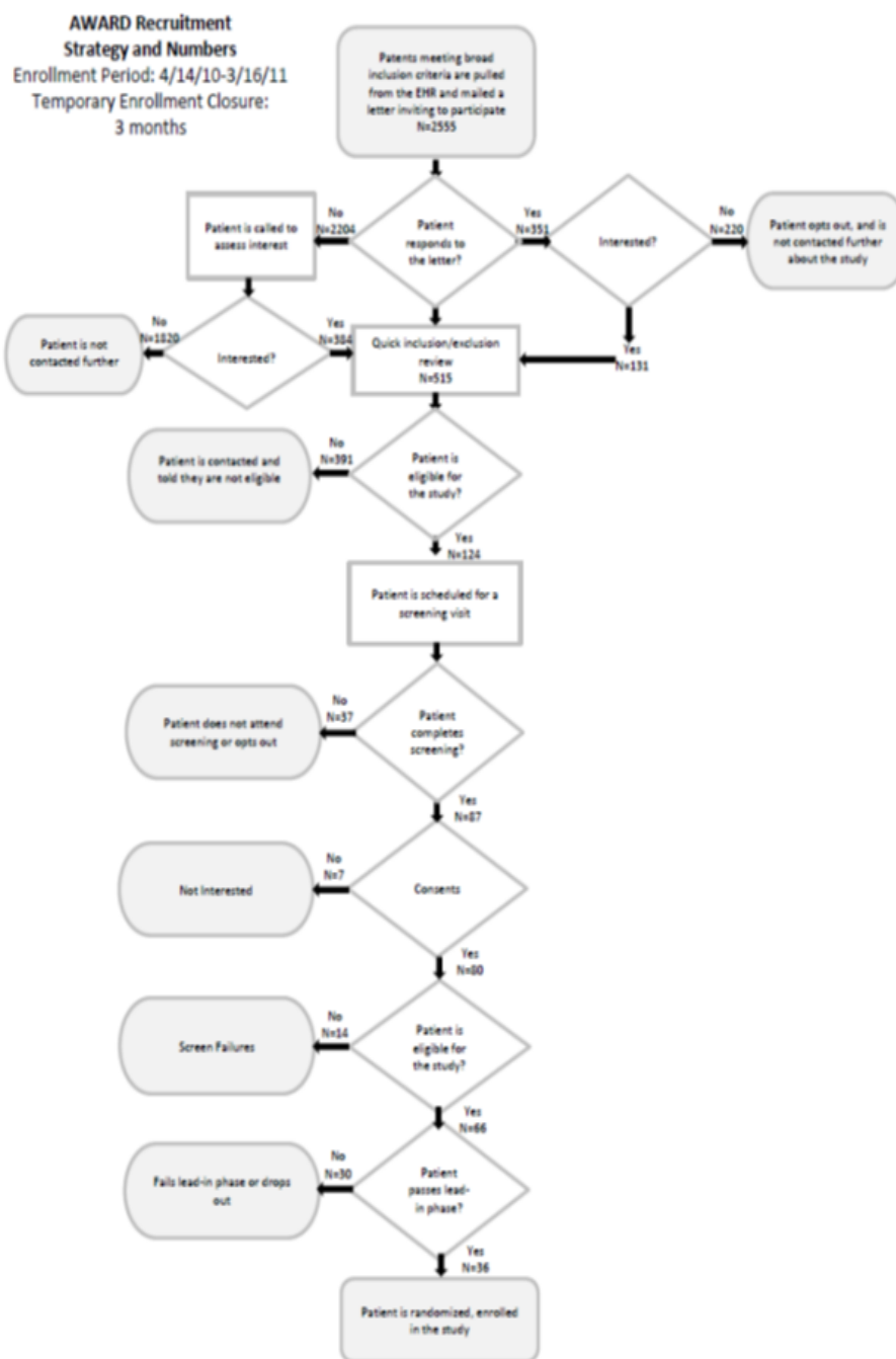
Figure 2: Award-1 Recruitment Strategy and Numbers.

HbA1c in patients with Type 2 diabetes who were taking metformin and pioglitazone [28]. There were 2,555 patients who met the study's broad inclusion criteria and were sent letters inviting them to participate in the study (Figure 2). An opt-out approach was used for this study. Initially, 351 of the 2,555 patients (14%) responded to the letter. After learning more about the study, 131 of the 351 (37%) spontaneous callers remained interested. Of the 2,204 patients who did not respond to the mailing, 384 (17%) expressed interest in the study after being contacted by research staff. After screening visits and a lead-in period on study drug, the Cardiovascular Center for Clinical Research enrolled a total