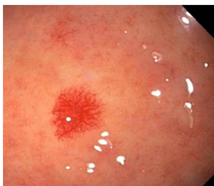
Figure 3: Gastric angiodysplasia.