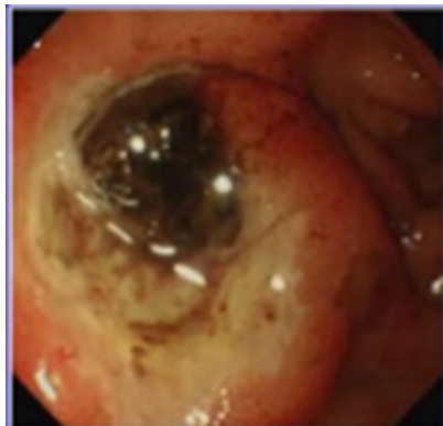
Figure 1: Peptic ulcer forrest class (Iib).

Mallory Weiss syndrome in 2% of the cases (n=16), gastric cancer in 3% of the cases (n=22), and in 5% of cases (n=38), the endoscopic aspect was normal.