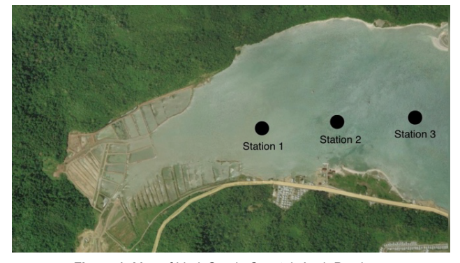
Figure 1: Map of Lhok Seudu Coastal, Aceh Province.

1 L water sample was filtered using Whatman 42 GF/C 42 \mu m filter paper. The filter paper containing chlorophyll-a is folded four times until it becomes a small fold and then inserted into aluminum foil. The chlorophyll-a sample folds are stored in the refrigerator at 4°C for a day.