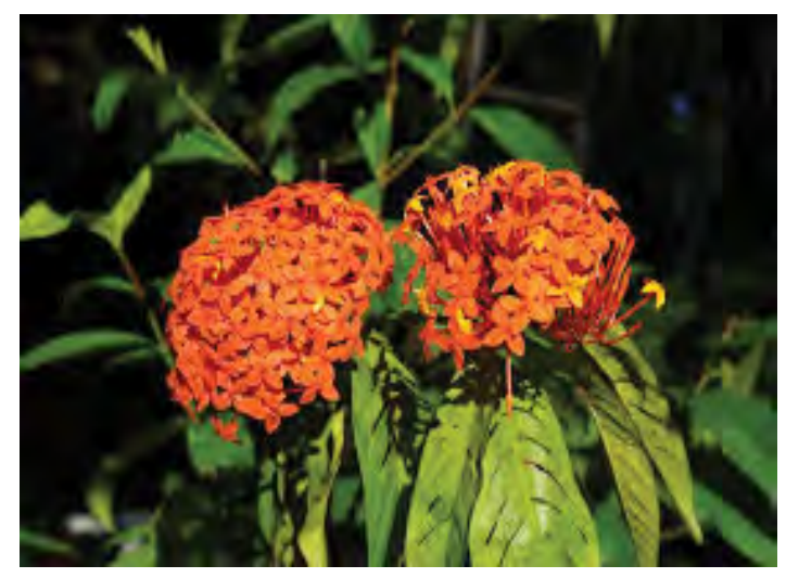
Figure 7: Saraca asoca.