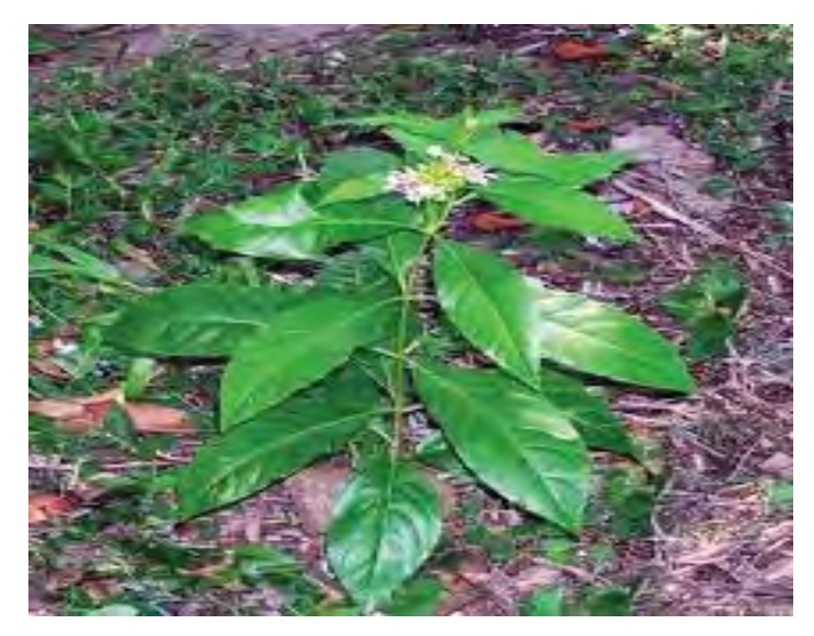
Figure 8: Rauvolfia serpentine.