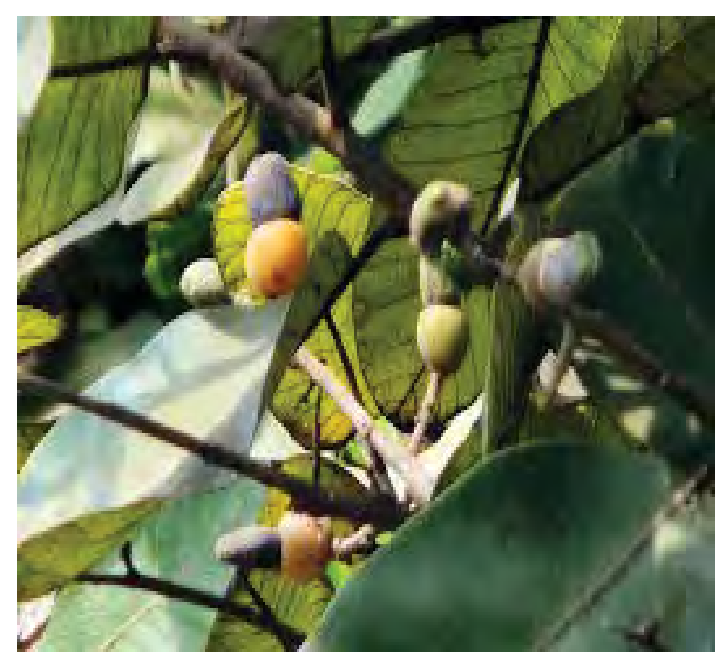
Figure 5: Semecarpus anacardium.

their health; marginally education status of tribal's is suboptimal 52(20.80%). Women's were (41.22%) participated collection of