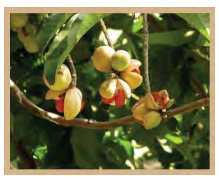
Figure 6: Aphanamixis polystachya.

land ownership has been the massive and steady transfer of lands previously held by tribal's communities and cultivators into the hands of non-tribals, this process of expropriation has continued unabated and makes jobless (especially tribal's youths ). Despite the enactment of laws in several states to protect tribal landowners from such exploitation, tribal land alienation has continued at disastrous pace –both through loopholes in the law, and in direct contravention of it. Tribals land alienation is the most cause of the pauperisation of tribal's people, rendering their economic situation, which is extremely vulnerable even at the best of times, even more precarious. Gained income from the Government programme, tribal's spent the money for children education and