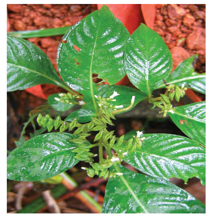
Figure 3: Ophiorrhiza mungos

their health; marginally education status of tribal's is suboptimal 52(20.80%). Women's were (41.22%) participated collection of