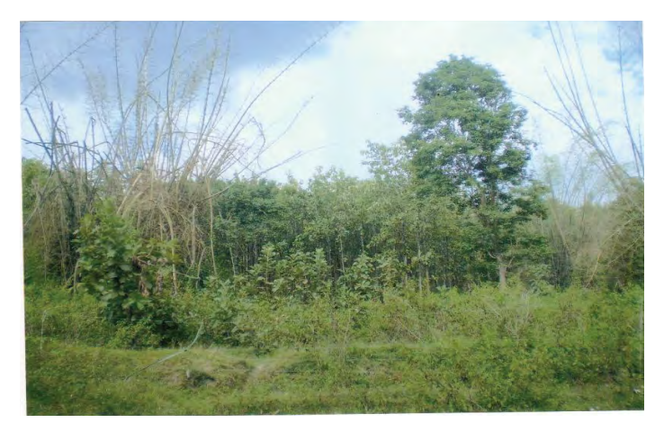
Figure 1: Floristic diversity of Western Ghats.

As per the results, the cumulative impact of over 75 years of post-independence, the government of India implemented many development programmes in tribal's rehabilitated areas under scheduled tribe sub plan eg Integrated tribal development project (ITDP) areas, in the Western Ghats region. Majority of the Tribal population actively participated in the development programme and economically benefited, Government of India allotted the minimum 1-2.50 acres of land for tribal's welfare interest inaccordnce with article 16 (2) and 341 of Indian Constitution. Free access to communally owned forest lands for agriculture by settled or shifting cultivation modes way to rights of cultivation requiring individual land titles. Approximately (12.51%) private