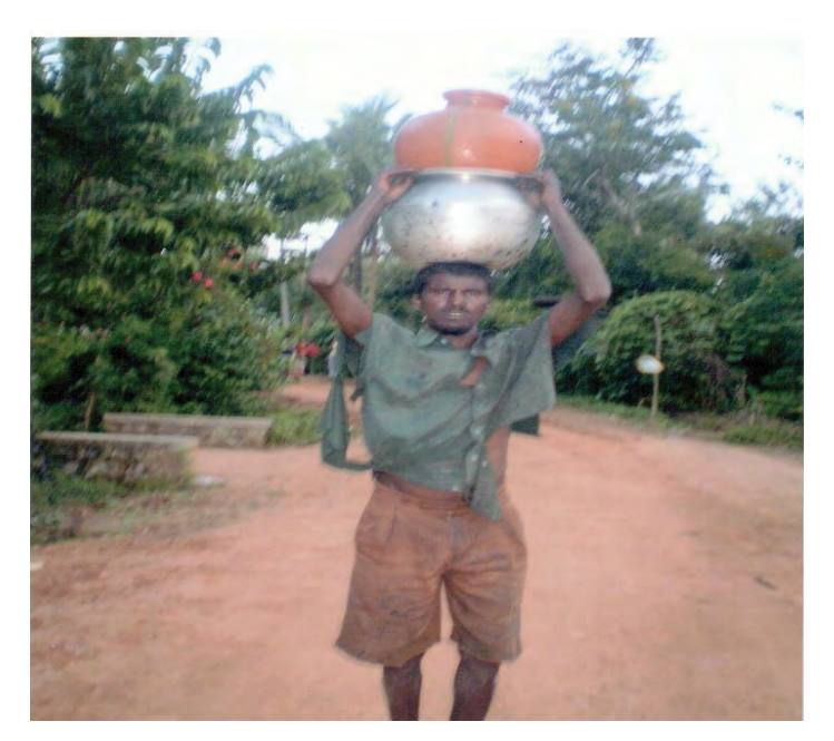
Figure 11: A poor tribal man fetches portable water from a distant place to his shelter.

live in remote hill forest, igloos and high altitude areas in Western