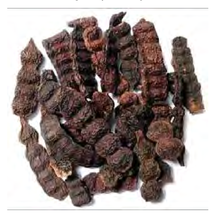
Figure 4: Acacia concina (Sigekai)

land ownership has been the massive and steady transfer of lands previously held by tribal's communities and cultivators into the hands of non-tribals, this process of expropriation has continued unabated and makes jobless (especially tribal's youths ). Despite the enactment of laws in several states to protect tribal landowners from such exploitation, tribal land alienation has continued at disastrous pace –both through loopholes in the law, and in direct contravention of it. Tribals land alienation is the most cause of the pauperisation of tribal's people, rendering their economic situation, which is extremely vulnerable even at the best of times, even more precarious. Gained income from the Government programme, tribal's spent the money for children education and