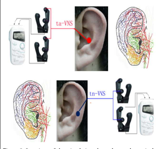
Figure 2: Locations of the stimulation electrodes on the auricular surface for taVNS and tnVNS.

measured at baseline and on the 28^{th} day of treatment. 17 HDRS, 14HAMA and SF-36 are to be assessed at baseline and on the 28^{th} day of treatment and the 14^{th} day of follow-up afterwards. The study design is detailed in Figure 1.