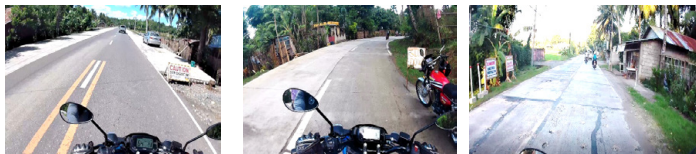
Figure 1: Photos show improper installation of traffic signs and symbols.

Police checkpoints are there to make the motorists aware of the