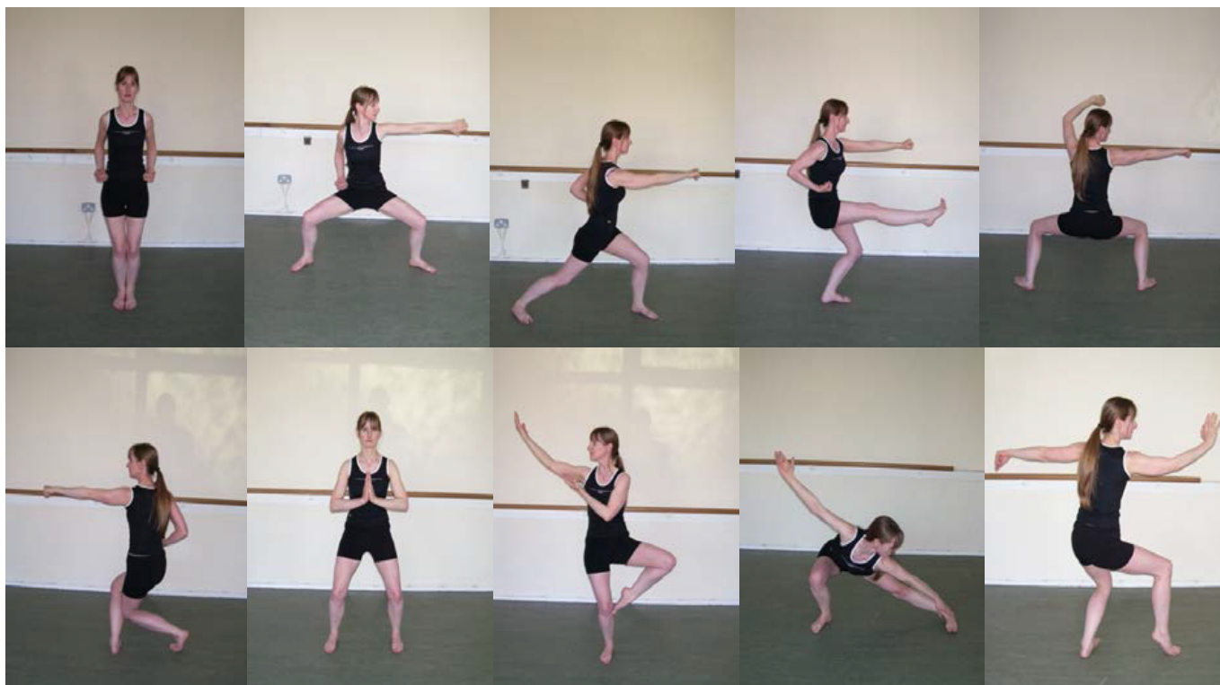
Figure 1: Wu Bu Quan form including start position, horse stance, bow and arrow stance, kick and punch, horse stance and punch, twisted stance, transition stance, single leg stance, crane step, cat stance.

feedback on the biomechanics of the student [24]. Any improvement gained during proprioception exercise is likely due in part to the attention required during such exercise, with repetitive training leading to the unconscious control [21].