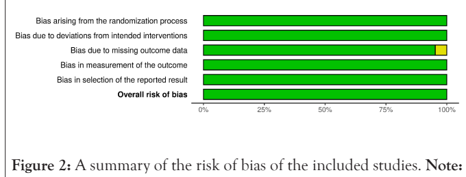
( Low risk; ( ) Some concerns.

found to have a low risk of bias (Figure 2). The unclear risk of bias in the domain of missing outcome data was negligible and cannot impugn the interpretation of results.