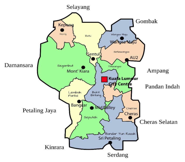
Figure 2: Location of Laman Standard Chartered Kuala Lumpur.

Source: Parliamentary map of the Federal Territory of Kuala Lumpur, Malaysia, 2015.