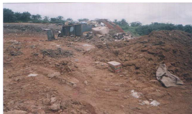
Figure 3: Government evacuating dumpsite via land fill technique (Source: field work, 2015).