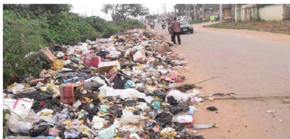
Figure 4: Indiscriminate dumping of waste along the road site at Okundi, Boki (Source: field work, 2015).