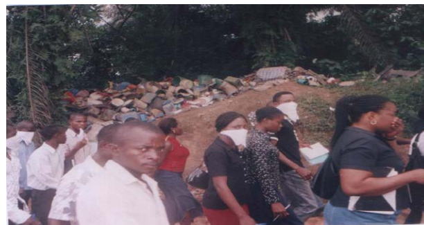
Figure 5: Students on field work, surveying un-evacuated dumpsite.

Wastes are complex in nature depending on the sources of generation [12]. Their effect on human health varies. In a case where some ten nursing, midwifery and public health students were reported to have slumped by inhaling the stench from a dumpsite behind the hospital [13]. The human attitudes on filthy environments influence waste generation and poor disposal in some towns and villages in Boki area [14]. The potential risks to health, environment and improper disposal near waste generation site, refuse collection methods, street cleansing, disposal and inadequate environmental awareness strategies of solid waste in Boki area, inform the rationale of this research to strike a balance between human behavior to solid waste and clean environment. This study upon successful completion is expected to form a base-line information that is indispensable to researchers and environmentalist whose basic works has implication of near-term practical environmental cleanliness and benefit the Government and the people of Boki on environmental sanitation and hygiene. They will appreciate the need to properly manage solid waste in homes and farms. And government will experience reduction in waste to the public dumpsite and around the roadside.