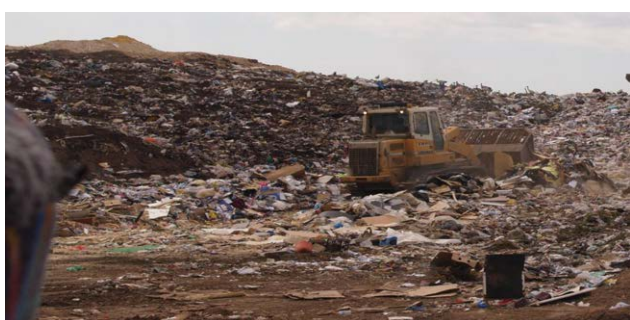
Figure 2: Government taking responsibility to evacuate wastes (Source: Field work, 2015 at Boje, Boki).

wherein some are implicated in the etiology of many ailments peculiar to humans [11]. The biodegradable content of the solid waste disposed at major public arena such as highways in Boki are mostly food remains, yard wastes, kitchen consumables and discarded papers/cartons. These materials may not have direct chemical implications, but constitute physical environmental nuisance, harbor bacteria and other poisonous insects; rodents and reptiles figures 4 and 5. In some five decades, issue associated with environment hasn't been of serious concern to the world. But recently due to increased urbanization, climate change, environmental pollution, global warming, ground and surface water pollution, general littering habit, poor refuse disposal in urban and rural areas and management of human waste. Perhaps the need to address this problem through environmental education is imperative.