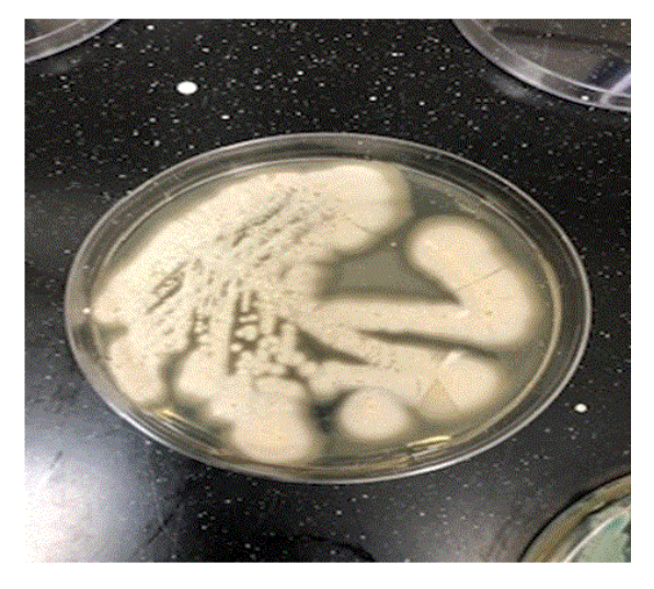
Figure 2: Blood culture: Yeast growth in Sabouraud dextrose agar.

The patient continued to experience active bleeding from her colostomy. An ACT scan showed mucosal thickening of the sinuses and ENT was contacted for possible debridement and biopsy. However, they could not proceed as the platelets had fallen precipitously and were refractory to any treatment and transfusions. The patient's renal profile was deteriorating daily and nephrology became involved to provide replacement therapy. Ten days later the patient started becoming hypotensive, requiring ionotropic support and hypothermic. Her blood culture grew Extensive Drug Resistant (XDR) Klebsiella. The patient was started on ceftazidime avibactam to which the organism was sensitive. All her central lines were changed and she was able to clear her bacteremia and her vital signs improved. The result of a rectal swab culture as part of ICU surveillance for Multi-Drug Resistance (MDR) showed fungal growth consistent with Trichosporon spp. This was sensitive to the ambisome the patient was receiving. The patient went through several events of bleeding secondary to severe pancytopenia for which she received blood products, IVIG, and plasma exchanges.