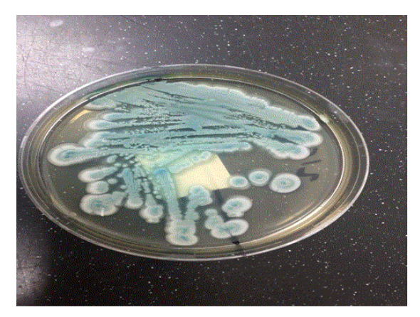
Figure 3: Blood culture: Yeast growth in CHROMagar.

The yeast isolated from the blood culture was identified as a Trichosporon species using API 20C AUX (bioM erieux, Mercy l'Etoile, France), which was sensitive only to voriconazole and flucytosine using Sensititre YeastOne® (Thermo Scientific) (Figures 2 and 3).