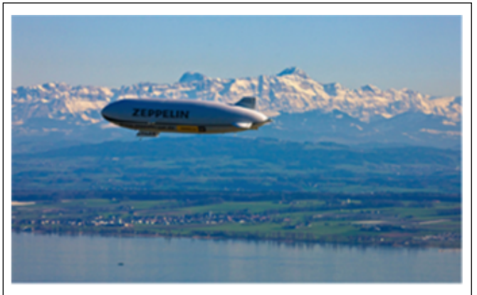
Figure 2: The Zeppelin NT over the Bodensee.

The Goodyear Tire & Rubber Company has provided airship rides in its blimps for over 60 years, but these trips are exclusively for corporate guests. In 2017, the last of the famous GZ-20 blimps operated by Goodyear, was retired. They continue to combine advertising and airship rides with a new fleet of three Zeppelin NTs which have replaced the original blimps.