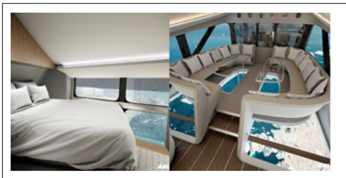
Figure 7: En visioned passenger accommodation on Airlander 10.

For most tourists, the Ocean Sky offering may seem as unattainable as the near space flights being offered by Sir Richard Branson and by Jeff Bezos. However, much larger airships have been built 85 years ago that could carry 65 passengers in comfort. The size of the airship makes little difference to natural world below, but could bring ticket prices down to earth, and expand the ecotourism market.