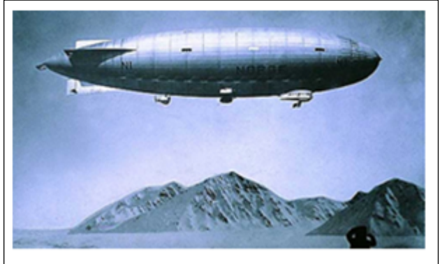
Figure 4: The Norge.

The Arctic region has a history of early exploration by airships, which was later followed by citizen-science polar research. In 1926, the Italian-built Norge was the first aircraft to reach the North Pole. The Norge was designed and piloted by Umberto Nobile, and sponsored by the Norwegian Air Association. The expedition included the famous explorer Roald Amundson, who had previously traveled overland to both the North and South Poles (Figures 4 and 5).