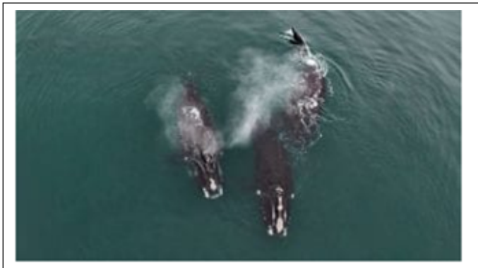
Figure 1: Drone image of North Atlantic right whales

Many species are disturbed by human generated sounds, like marine propellers. Whale-watching boats in the St. Lawrence estuary and off the Atlantic and Pacific coasts need to observe strict distancing requirements from the whales in order to reduce stress for the animals. Using current technology, ecotourism may already be approaching its maximum limits for whale-watching (Figure 1).