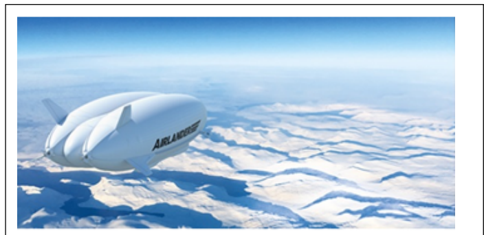
Figure 6: Artist's concept of Airlander 10 flying over the Arctic.

As the 100th anniversary of first airship journey to the North Pole approaches, an adventurous airship ecotourism passenger service is being organized by Ocean Sky, based in Sweden. They propose to take up to 16 passengers to the North Pole from Svalbard, using a Hybrid Air Vehicles (HAV) Airlander 10 airship. A true luxury expedition, these flights are expected to last 36 hours and cost $250,000 USD [7-9] (Figures 6 and 7).