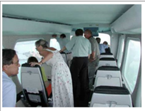
Figure 3: Gondola of the Zeppelin NT.

Although Zeppelin and Goodyear have been operating small airships successfully for decades, others have found it difficult to operate a commercial tourist service profitably. Sky cruise Switzerland operated tourist flights between 2002 and 2007, with two Sky ship 600 blimps that can carry up to 13 passengers. They engaged the advertising market and provided security at the summer Olympics at Athens, but by 2010 they had ceased operations.