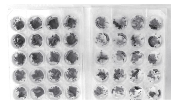
Figure 2: Antifeedant effect of seed coatings treated diet by fourth-instar Agrotis ypsilon Rottemberg over 48 hours.

Anitifeedant activity of seed coatings is presented in Table 5. As