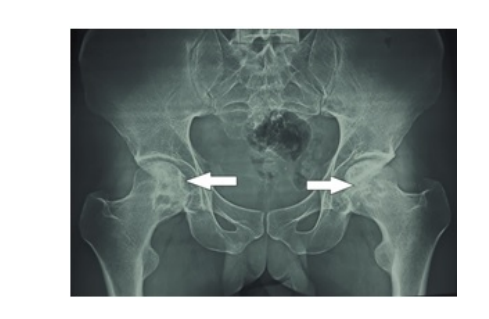
Figure 1 : Plain skiagram of pelvis antero-posterior view shows bilateral heads of femur have got multiple radiolucencies (white arrows).

28-years old male reported with the complaints of pain in both the hips of approximate two years duration. The symptoms were mild to begin with but have shown progression in two years. There was no relief with the symptomatic treatment in the local dispensary. He reported to the orthopedic department now with pain and difficulty in walking. On examination he was well built with normal physique without any visible disability. There was no history of trauma or any systemic disease like diabetes, hypertension, renal disease or thyroid problem. He was not on any long term medication for any systemic disease. He was not able to put weight on his hip joints and was able to walk with the stick. The movements were slightly painful and restricted. Systemic examination was unremarkable. All the biochemical parameters were within normal limits. Patient was subjected to plain bilateral hip joints anteroposterior and frog leg oblique views X-ray examination. Plain skiagram revealed the radiolucencies in both the femoral heads with more on left side. There was also mild subchondral sclerosis observed (Figures 1 and 2).