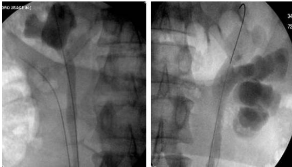
Figure 3: Intra-operative retrograde pyelogram showing the patient's upper urinary tract anatomy bilaterally.

The stone in the mid third of the upper moiety ureter was completely disintegrated using LASER, however the stone in the upper third of the lower moiety was pushed back and both ureters were stented. Three weeks later, the patient underwent cystoscopy with removal of all three stents along with repeat bilateral ureteroscopy. This revealed some residual fragments on the left side requiring LASER lithotripsy and replacement of the stent, due to the severe impaction and oedema some minor mucosal abrasions. While on the right side both limbs did not have any significant residual fragments. To this effect, the patient was discharged after satisfactory post-operative recovery with a view of right lower moiety ESWL as well as full 24 hours' urine in six weeks time for metabolic work up. The stone in the lower calyx of the left kidney will be kept under observation (Figure 4).