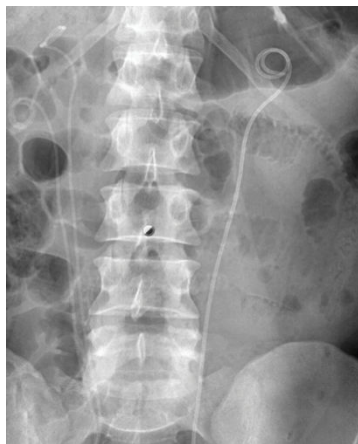
Figure 4: Post operative plain X-ray KUB, showing no significant residual fragments bilaterally with satisfactory position of all three stents.

The stone in the mid third of the upper moiety ureter was completely disintegrated using LASER, however the stone in the upper third of the lower moiety was pushed back and both ureters were stented. Three weeks later, the patient underwent cystoscopy with removal of all three stents along with repeat bilateral ureteroscopy. This revealed some residual fragments on the left side requiring LASER lithotripsy and replacement of the stent, due to the severe impaction and oedema some minor mucosal abrasions. While on the right side both limbs did not have any significant residual fragments. To this effect, the patient was discharged after satisfactory post-operative recovery with a view of right lower moiety ESWL as well as full 24 hours' urine in six weeks time for metabolic work up. The stone in the lower calyx of the left kidney will be kept under observation (Figure 4).