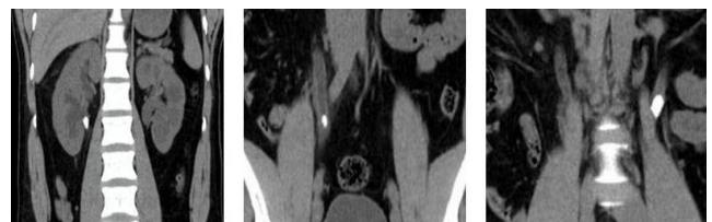
Figure 2: Plain Spiral CT scan images. Left: A calculus in the upper third of the right inferior moiety ureter. Middle: A calculus in the mid third of the right superior moiety ureter. Right: A calculus in the upper third of the left single ureter.

Another calculus measuring 1 × 0.6 cm was seen in the mid third of the upper moiety ureter. On the left side there was a single ureter with a 1.7 × 0.9 cm calculus in its upper third along with a 5 mm × 3 mm lower calyceal stone. All ureteric calculi (Figures 1 and 2) were obstructing with at least grade III proximal hydro-ureteronephrosis and mild to moderate perinephric fat stranding.