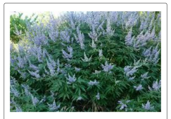
Figure 2: Nochi.

Lining of uterus develops outside the patient's uterus which is called endometriosis. This is can be treated with the herb nochi which is shown in Figure 2.