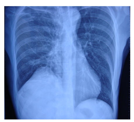
Figure 1: Preoperative chest X-ray showing an elevated right-side diaphragm.

Clinically, the left-sided congenital diaphragmatic hernia is more common than right-sided. The population-based data from ongoing studies in the California Birth Defects Monitoring Program (CBDMP), Anne M. Slavotinek compared 146 CDH cases, 38 with R-CDH (26%) and 108 with L-CDH (74%) [4]. In addition, the majority of herniated organs at left are the omentum, bowel, spleen, stomach, kidney, and pancreas. Because of the right side of the pleuroperitoneal canal closing earlier, liver as the herniated organs is extremely rare [5].