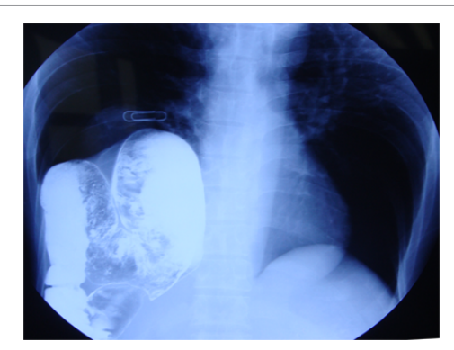
Figure 3: Barium enema showing colon herniated into the thorax cavity.