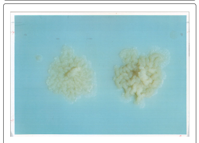
Figure 3: Colony Morphology of M.tuberculosis - Dry wrinkled warty growth, Eugonic

Figure 2: LJ Media showing classical growth characteristics of M. Tuberculosis isolated from pleural Fluid