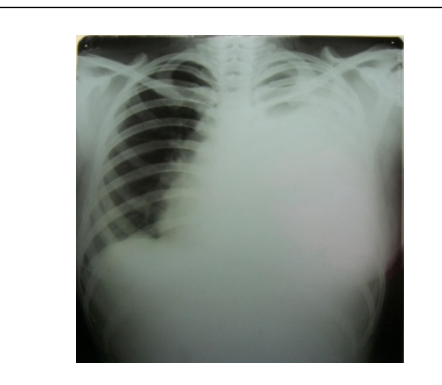
Figure 1: chest X ray PA showing massive pleural effusion-left side

Statistical analysis was done mainly by student t test to compare two variables and Chi square test when comparing many variables. P value was considered significant if it was below 0.05 and highly significant in case <0.001. A significant value of t was seen from table for degree of freedom. In our study, p value < 0.05 was considered as significant with either negative or positive correlation on account of biological variability.