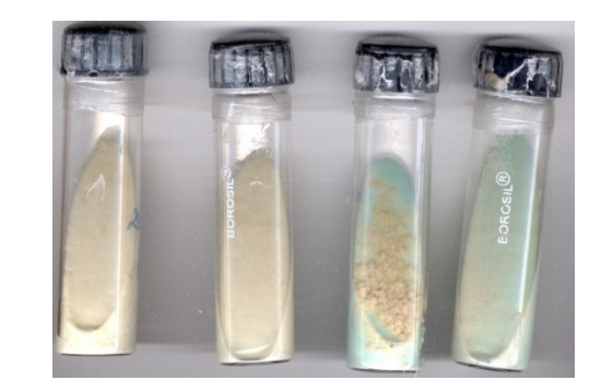
Figure 2: LJ Media showing classical growth characteristics of M. Tuberculosis isolated from pleural Fluid