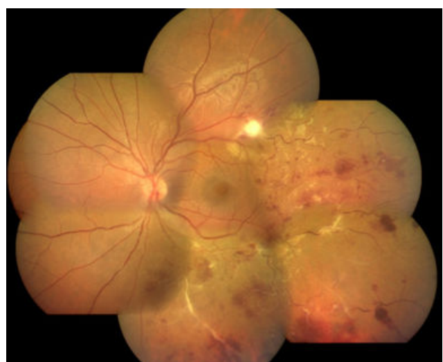
Figure 2: Retinal haemorrhages, soft exudates, sheathing, in an SLE patient.

Optic disc pallor was documented in six of 18 eyes. Additionally, one eye had glaucomatous optic atrophy secondary to iris neovascularization and neovascular glaucoma. Combined central retinal artery and vein occlusion was seen in one eye of one patient, who was a diagnosed case of antiphospholipid antibody syndrome (APLS). SLE choroidopathy was present in only one eye Figure 3.