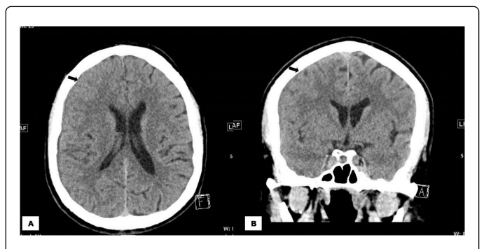
Figure 1: Axial (A) and coronal (B) sections of non-contrast CT brain show mild effacement of right frontal sulci (black arrows), with no discernible mass effect or midline shift.

In view of inconclusive CT findings and sudden clinical deterioration, a lumbar puncture was performed to look for signs of intracranial infection. The cerebrospinal fluid (CSF) analysis revealed an infective picture (leucocytosis and increased protein levels). Meanwhile, his condition further deteriorated and GCS dropped to 7.