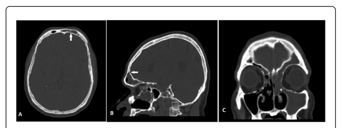
Figure 3: A,B) Bone window CT images of the head showing the focal bone defect (arrow in image A and B) in the posterior wall of the left frontal sinus. C) Coronal image showing the extent of sinusitis. Left osteomeatal unit was completely obstructed (arrow) by the mucosal thickening.

He underwent right decompressive craniectomy and evacuation of subdural empyema. Frank pus was drained which contained Streptococcus intermedius sensitive to multiple antibiotics. In the same sitting, he underwent functional endoscopic sinus surgery (FESS) to address the sinusitis. The pus from the infected sinus had the same organism and antibiotic sensitivity as the empyema. Post-operatively, he was treated with intravenous antibiotics (intravenous Meropenum and Vancomycin for 2 weeks) and stayed in intensive care unit for five days. His condition improved gradually and the follow up CT (Figure 4) showed improvement of mass effect and cerebral oedema. After 20 days of hospital stay, he was discharged with good neurological status. The inflammatory markers demonstrated a gradual decline and the CRP was 51.4 mg/L at the time of discharge. There was no change in his personality or cognitive functions. No motor or sensory deficits were observed upon discharge.