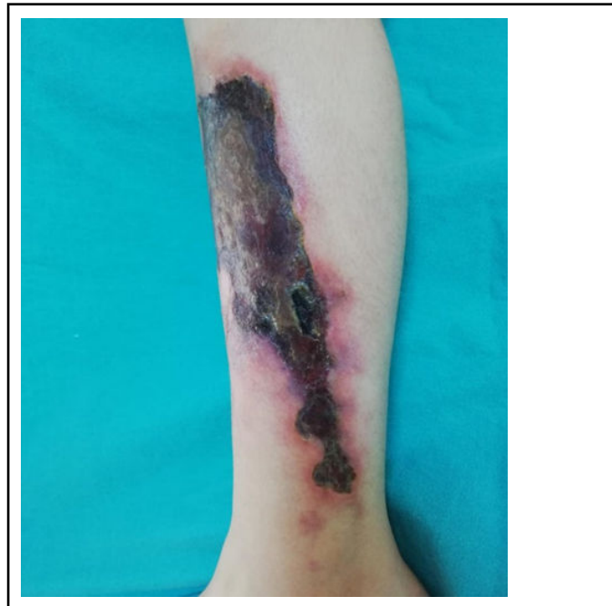
Figure 1: Destructive crusted ulcer with sharply limited on the erythematous base located on the leg.

mycophenolate mofetil, amlodipin and low dose (10 mg/day) of methylprednisolone. Skin examination revealed painful crusted ulcerations with overhanging border on the erythematous base, about 15*5 cm in size, on her legs (Figure 1). The other system examinations were unremarkable. Laboratory investigations showed a white cell count of 8.14*109/L(3.8-10.8*109), an absolute lymphocyte count of 0.26*109/L, hemoglobin of 10.3 g/dL (11.1-17.1), and a platelet count of 600*109/L (140-360*109). Serum C-reactive protein was 3.14 mg/L (0-5) and erythrocyte sedimentation rate 80 mm/h (0-20). Results of coagulation tests were within the normal range. Laboratory investigations gave positive results for ANA and double-stranded DNA antibodies (>150 IU/mL; 0-18). Complement (C3 and C4) levels were low.