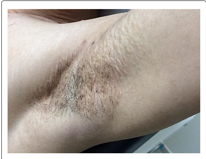
Figure 2: Cobblestone like yellowish papules and comedones, distributed on the axilla.