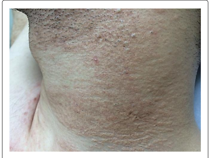
Figure 1: Cobblestone like yellowish papules, symmetrically distributed on the sides of the neck.

blood pressure measurement, an electrocardiogram (ECG) and also an examination of arterial stiffness. Furthermore, the patient has been subjected to an abdominal echography. Patient had no cardiovascular or haemorrhagic events. Complete blood cell count and urine analysis were done, which were within the normal limits. There was no family history. Skin biopsy was taken and sent for histopathological examination. On hematoxylin and eosin (H and E) staining, elastic fibers in the middermis are seen to be clumped, degenerated, fragmented and swollen (Figure 4).