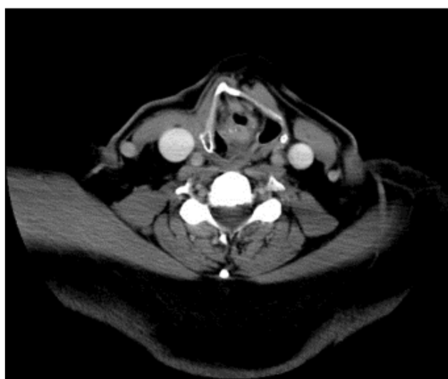
Figure 2: Post-treatment CT scan showing significant interval improvement.

The development of MALT lymphoma from Hashimoto's thyroiditis takes a long time, sometimes as long as 30 years. MALT lymphoma is generally characterized by an indolent clinical course, although transformation from MALT lymphoma to aggressive lymphoma may occur in some cases [8].