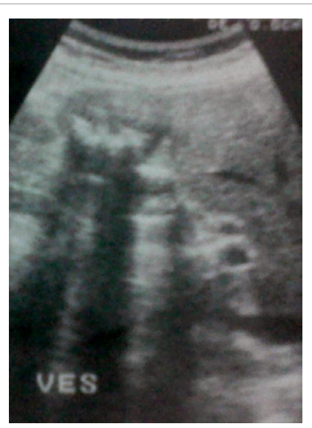
Figure 1: Ultrasound: cholelithiasis.

A complete course of anti-tubercular treatment was administered for 6 months (4 drugs during 2 months: Isoniazid: 4 mg/kg per day, rifampicin: 10 mg/kg per day, pyrazinamide: 25 mg/kg per day and