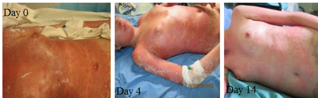
Figure 4: Clinical effects of using amniotic drafts in toxic epidermal necrolysis on day 0, 4 and 14.

The amniotic membrane combined with deproteinized bovine bone mineral [BMM) was compared in clinical trials with the collagen membrane combined with BBM as to their efficiency in the treatment of periodontal inflammations. It was proved that both the use of amniotic membrane and collagen membrane combined with deproteinized BBM improves the condition of periodontium in the studied patients. The amnion did not cause a significant gum recession and is considered to be a new barrier membrane in the treatment of such diseases [35]. Another disease of the oral cavity is temporomandibular joint ankylosis, which is a serious condition, mainly due to injuries responsible for the reduction of mandible functionality. The amnion was used in the treatment of such injuries as an interdisciplinary membrane characterized with functional adjustment capabilities, non-immunogenicity and low cost. The study proved that the amniotic membrane is a biocompatible material which can find its application in the treatment of temporomandibular joint ankylosis as a good alternative for the prevention of recurrence of ankylosis and restoration of satisfactory functionality of the joints [36].