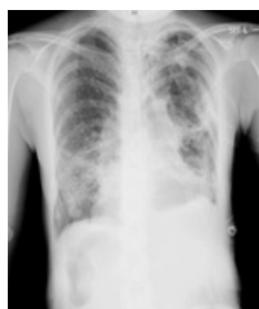
Figure 1: Chest X-ray showing dextrocardia, bronchiectasis, bronchial wall thickening and diffuse small nodular or linear shadows in both lung fields. A right-sided stomach bubble suggests situs inversus.