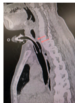
Figure 3: Granulation at the head of the entrance to the pneumatic cannula (red arrows).

Due to the extremely poor respiratory status, the presence of granulation around the tracheal incision (Figure 3), and the expectation of difficulty in differential lung ventilation with a double-lumen tracheal tube because of visceral inversion, we decided not to perform differential lung ventilation by replacing the tracheal incision cannula, but rather to conduct this procedure under cardiopulmonary bypass from the beginning of surgery. The patient was admitted to the operating room in a wheelchair and was relatively well oxygenated under a ventilator, but had marked hypercapnia (PaCO 2 88.5 mmHg) (Table 1). In parallel with induction of anesthesia, the left femoral artery and vein were taped so that extracorporeal circulation could be used in case of a sudden change. However, as planned, after opening the chest, we started cardiopulmonary bypass with the left femoral vein, superior vena cava devascularization, and ascending aortic transmission. Anesthesia was maintained with propofol as a general anesthetic, since it is less inhibitory for airway striae movement compared to volatile anesthetics [5].