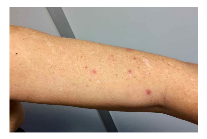
Figure 2: Erythematous papules, some of them excoriated, on the upper limb.