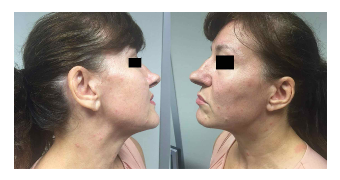
Figure 1: Erythematous papules and plaques on the face and neck.