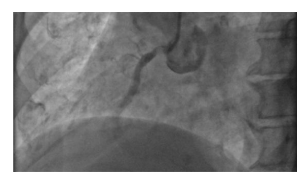
Figure 1: Coronary angiogram of the right coronary artery showing 95% thrombotic ostial occlusion.

On physical examination, vital signs were stable. His cardiovascular examination revealed a 2/6 ejection systolic murmur in pulmonary area. No other murmurs were heard. The respiratory system examination and rest of the systemic examination was unremarkable. His chest X-ray and laboratory results were normal. His electrocardiogram revealed right bundle branch block with right axis deviation in sinus rhythm with 1st degree heart block. His echocardiography revealed a 20 mm ostium secondum atrial septal defect (OS-ASD) with deficient inferior and aortic margins with left to right shunt (Qp:Qs was 1.9:1), normal left ventricular systolic function without any regional wall motion abnormality. His coronary angiography revealed ostial 95% thrombotic occlusion of the right coronary artery (RCA) (Figure 1).