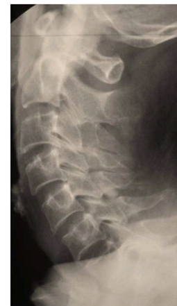
Figure 1: Radiographs of the cervical spine showing calcification in the interlaminar space C5-C6.

The present case indicates that CLF can mimic the clinical features of a spinal infection. In the literature, the diagnosis of acute and febrile neck pain due to CLF has been rarely reported [2]. It has been ascribed to a flare of inflammation at the calcified sites. Female over 60 years are particularly prone to this disease. In the early stage, patients complain of occipital headaches, neck pain, or sensory abnormalities in the upper and lower extremities with restricted cervical movements. Neurologically, sensory disturbance of the upper and lower extremities, gait disturbance and tetraparesis are generally present [3]. As in our