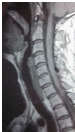
Figure 2: spinal MRI with Sagittal image showing low-intensity signal on T1 weighted sequences in the inter-laminar space C5-C6.