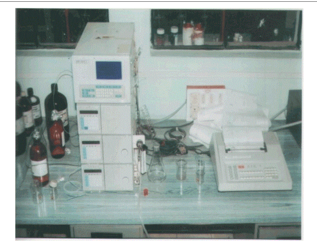
Plate 2: HPLC assembly used for estimation of beta carotene

Citation: Garande VK, Patil RS (2014) Orange Fruited Tomato Cultivars: Rich Source of Beta Carotene. J Horticulture 1: 108. doi:10.4172/ horticulture.1000108