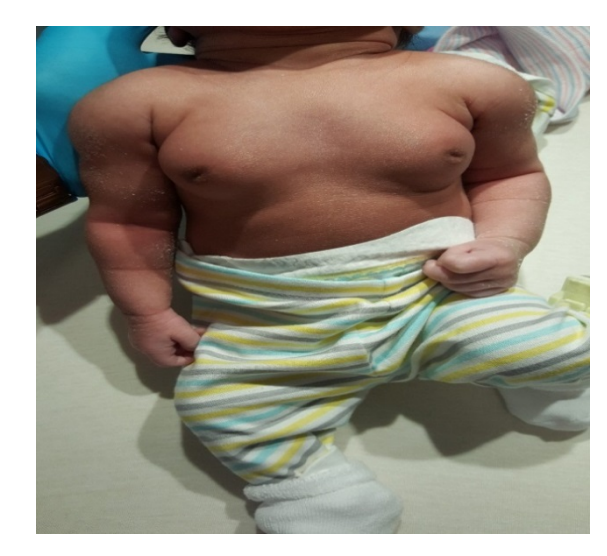
Figure 1: Infant having bilateral symmetric breast enlargement.

The development of breast tissue starts around 5 weeks of gestation [3]. Mammary glands begin to develop as ingrowths of ectoderm into the underlying mesodermal tissue. The ingrowing mass of ectodermal cells become a pouch and then grows out into the surrounding mesoderm as a number of solid processes that represent the gland's future ducts. At 28 weeks of gestation, estrogen stimulates lactiferous ducts, progesterone stimulates the development of lobular tissue and alveolar budding stimulates the development of the breast tissue, inducing canalization, forming the lactiferous ducts [2,4].