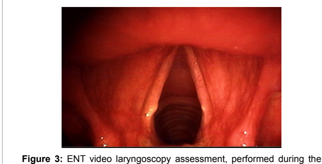
Figure 3: ENT video laryngoscopy assessment, performed during the follow-up, shows resolution of the edema and of the hyperemia of the vocal cords, along with a complete recovery of their motility.

No patient experienced complications associated with the PSE procedure, and none developed clinically significant changes in