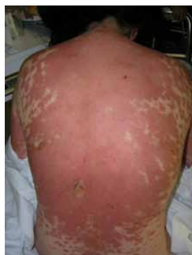
Figure 1: Erythematous at neckline and thorax.