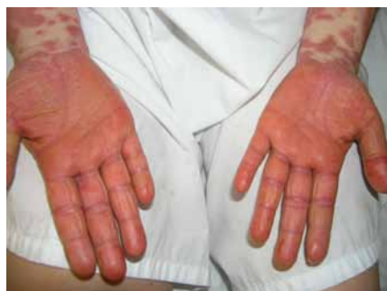
Figure 2: Erythematous at palm plantar and extremities regions.