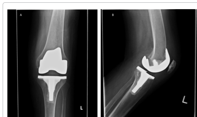
Figure 2a,b: Anteroposterior and lateral radiographs of a knee status post total knee arthroplasty.

Kalisvaart et al. performed a five-year study comparing different rotating-platform and fixed-bearing total knee designs and found that knee range of motion, function (measured via Knee Society Score and