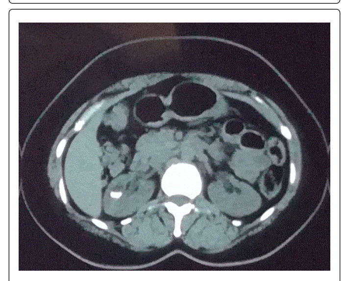
Figure 2: Demonstrates layering of calcium 2.

Calyceal diverticula are usually asymptomatic and do not warrant any treatment. There is a probability of it becoming symptomatic or getting complicated (infections, stone formation, MOC) which might require surgical intervention. The various surgical options available are PCNL, ESWL, Endoscopic manipulations, nephrectomy, hemi or partial nephrectomy (Figures 3 and 4).