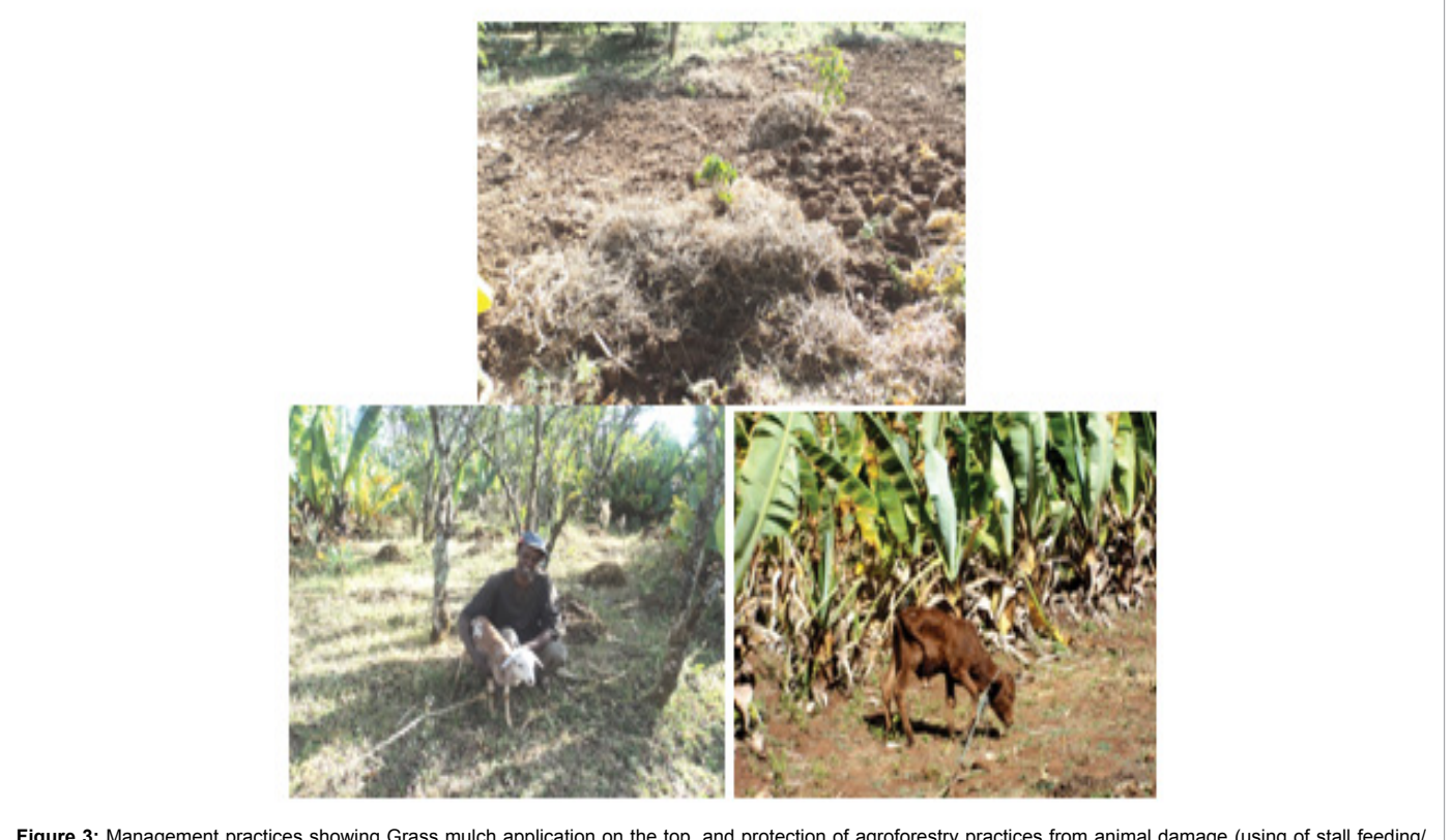
Figure 3: Management practices showing Grass mulch application on the top, and protection of agroforestry practices from animal damage (using of stall feeding/ partial captive grazing for animals in the system) in Gununo Watershed.