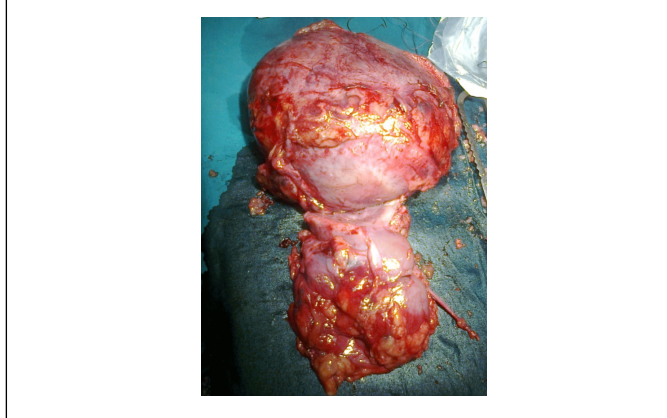
Figure 2: Specimen of right sided pheochromocytoma with kidney

Post-operative bone scan was performed which was normal. She was referred to oncology for adjuvant chemoradiotherpy.