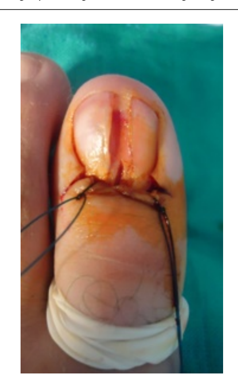
Figure 1: Longitudinal median body.

Mrs. HB, 40 years old, a hair dresser, is followed for rheumatoid arthritis under anti-inflammatories. For 4 years, she has presented a painful and unsightly swelling of the nail of the right big toe.