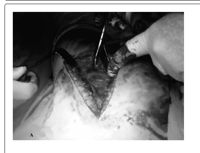
Figure 3a: The gluteus maximus is exposed, there seemed to be a band 1.4cm by 4 cm, separate from the main gluteus maximus insertion

Plain radiographs and magnetic resonance imaging of the hips were abnormal (Figure 1). Blood investigations, including complete blood picture, were also normal.