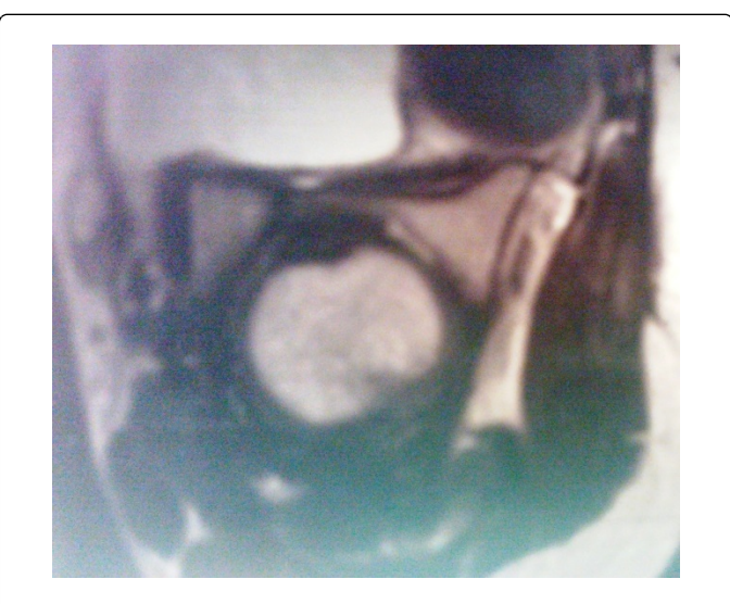
Figure1: MRI scan of the hip showing an abnormal band on T2 images, passing across the posterior part of the hip to the greater trochanter

In the year 2013, three boys (six hips) presented to Hawler teaching hospital with history of inability to properly sit on the floor since infancy. The condition was bilateral. Mean age was 8 years (from 5 to 12). Two of these patients were brothers.