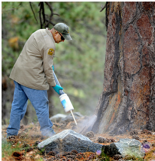
Figure 2b: Plague countermeasures at Table Mountain Campgrounds in the Angeles National Forest near Wrightwood, CA. Figure 2b depicts crews from the County of Los Angeles Agriculture Weights and Measures were spraying Delta Dust to kill the fleas from squirrels and chipmunks around the entrance of burrows and at the base of trees containing squirrel nests in the same area. (Photo by Walt Mancini/SGVN; reprinted with permission).

Figure 2a depicts a Plague Warning sign at the Table Mountain Campground in the Angeles National Forest Thursday, July 25, 2013. Closure signs were posted at three other campgrounds: Broken Blade, Twisted Arrow and Pima Loops of the Table Mountain Campgrounds in the Angeles National Forest near Wrightwood due to plague found in a ground squirrel. All these sites were officially closed at 1:00 p.m. Wednesday, July 24, 2013 for duration of at least 7 days. (Photo by Walt Mancini/SGVN; reprinted with permission).