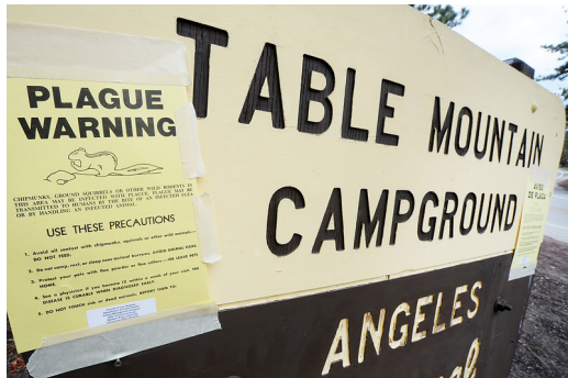
Figure 2a: Table Mountain Campgrounds in the Angeles National Forest near Wrightwood, CA, (closed to the public as of July 24 th 2013)

Figure 2a depicts a Plague Warning sign at the Table Mountain Campground in the Angeles National Forest Thursday, July 25, 2013. Closure signs were posted at three other campgrounds: Broken Blade, Twisted Arrow and Pima Loops of the Table Mountain Campgrounds in the Angeles National Forest near Wrightwood due to plague found in a ground squirrel. All these sites were officially closed at 1:00 p.m. Wednesday, July 24, 2013 for duration of at least 7 days.