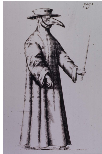
Figure 1: The Plague Doctor (German woodcut, around 1650). The image appears in: “ Thomas Bartholin; Historiarum anatomicarum...Hafniae, 1654-1661 ”. The person depicted in the image is wearing a hat, goggles, and a long gown, in addition to a mask shaped in the form of a bird beak. Historic descriptions indicate that the gown was apparently made from heavy fabric or leather and was usually waxed. The beak may contained piquant substances, which were believed to purify the air and protect from the disease. The rod, worn in the person’s left hand was likely used to keep patients at a distance.

This image is provided by courtesy and of the National Library of Medicine reprinted with the permission.