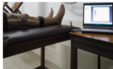
Figure 1: Initial position of JPS measurement.