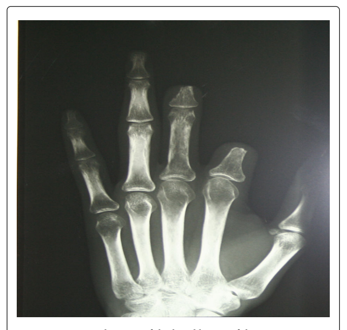
Figure 3: Demineralization of the hand bones of the in a SLE patient with digital necrosis.

The left radial and ulnar pulses were weakened and cardiac hyperretism. The rest of the physical examination was normal. The blood count was normal, the C-Reactive Protein was 24 mg/l, and the first hour ESR 50 mm, BUN and serum creatinine and 24-H proteinuria as well as U/A were normal. HIV serology and AgHbs were negative. The anti-U1RNP, anti SmRNP and anti Sm antibodies were all greater than 8 (according to laboratory standards, these values are positive if they are greater than 1.2). The p-ANCAs were positive, with an anti-MPO and anti-PR3 negative. Anti-scl-70, anti-centromere, anti-Jo-1, anti-SSA/Ro, SSB/lupus anticoagulant and anti-phospholipids antibodies (anticardiolipin, lupus anticoagulant and anti- \beta 2-glycoprotein I) were negative. The radiograph of the hands showed a bone demineralization (Figure 3).