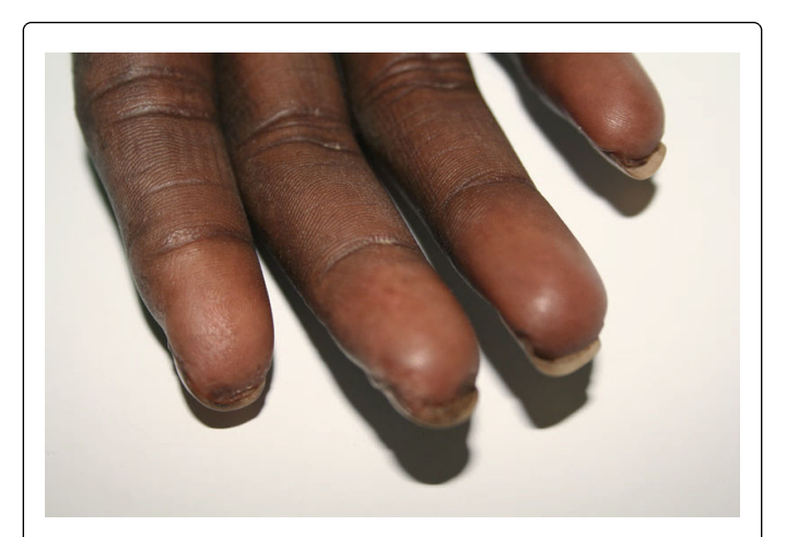
Figure 2: Finger scarring in a SLE patient with Raynaud phenomenon.

The left radial and ulnar pulses were weakened and cardiac hyperretism. The rest of the physical examination was normal. The blood count was normal, the C-Reactive Protein was 24 mg/l, and the first hour ESR 50 mm, BUN and serum creatinine and 24-H proteinuria as well as U/A were normal. HIV serology and AgHbs were negative. The anti-U1RNP, anti SmRNP and anti Sm antibodies were all greater than 8 (according to laboratory standards, these values are positive if they are greater than 1.2). The p-ANCAs were positive, with an anti-MPO and anti-PR3 negative. Anti-scl-70, anti-centromere, anti-Jo-1, anti-SSA/Ro, SSB/lupus anticoagulant and anti-phospholipids antibodies (anticardiolipin, lupus anticoagulant and anti- \beta 2-glycoprotein I) were negative. The radiograph of the hands showed a bone demineralization (Figure 3).