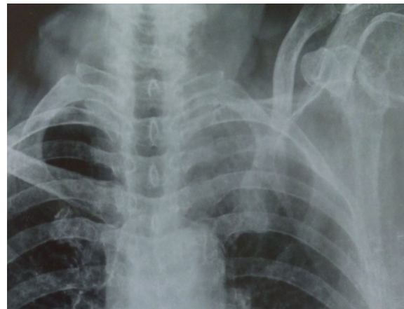
Figure 1: Chest X-ray PA view showing irregular lytic lesion involving medial half of the clavicle and a soft tissue opacity seen in the left upper zone, extending into the neck. Margins of the opacity could not be well appreciated.

A 60 years old post-menopausal female presented to the gynecology OPD of another hospital with complains of vaginal bleeding and pelvic pain for 6 months. Endometrial biopsy revealed high grade endometrial adenocarcinoma. She underwent surgical staging with radical hysterectomy and bilateral salpingo-oophorectomy for the same 1 year back. Findings were consistent with FIGO stage IIIA grade 3 endometrial adenocarcinoma. She was referred to the outpatient department of our institute for postoperative radiotherapy. Patient was discussed in multidisciplinary clinic and was planned for adjuvant radiotherapy to whole pelvis to a dose of 50 Gy in 25 fractions by 4 field technique followed by Intra Vaginal Brachytherapy after proper consent. During the treatment (after receiving 14 Gy in 7 fractions of pelvic radiotherapy), she started complaining of pain and swelling in the left clavicular region. On local examination, the swelling was about 3×3 cm in size, hard, fixed to underlying structures; tender with normal overlying skin. The swelling was progressively increasing in size. The general physical examination was unremarkable.