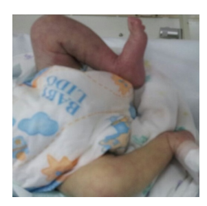
Figure 2: The effect of IV milk on leg of baby