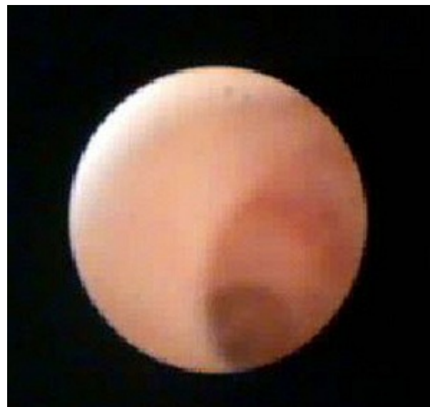
Figure 3: Spyglass pancreatogram showing a dilated MPD filled with mucin.