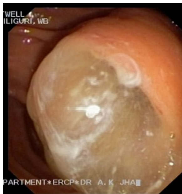
Figure 4: Endoscopic view of patulous major papilla filled with mucinous material (arrow).

SpyGlass pancreatoscopy showed a dilated and mucin filled dorsal duct. No villous projection was seen (Figure 3).