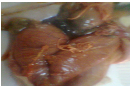
Figure 1: Nematodes worm in the gonads.

In general, 210(70%) of 300 examined Clarias lazera were infected with Nematodes and Cestode (43.6%). The fishes sampled were infected with Nematode (81.8%), and Cestode (12.7%) (Figure 3). The intensity of helminth infection by the nematode was heavy with more than 30 worms/fish with an average of 13.38 \pm 0.95 , the intensity of infection with the Cestode was 4.0 \pm 0.5 for high intensity. A few of C. lazera recorded concurrent infection with the both parasites as co-infection with intensity of infection 6.15 \pm 0.2 (Table 1).