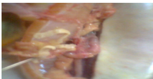
Figure 2: Cestodes worm in the intestine.